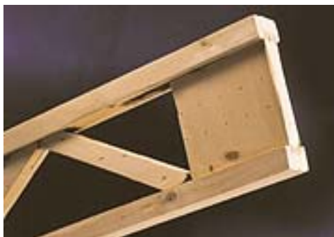
Finger-jointed truss FIGURE 4