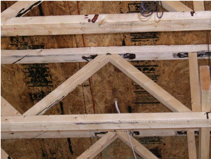
Figure 2: Close-up of finger-jointed trusses

This type of commentary raises serious questions about finger-joints from the perspective of fire safety. How do the glues used in finger-joints perform in fire conditions? Are the finger-joints a weakness? How do finger-jointed structural building components perform in fire? This document will answer these questions as they regard finger-jointed trusses.