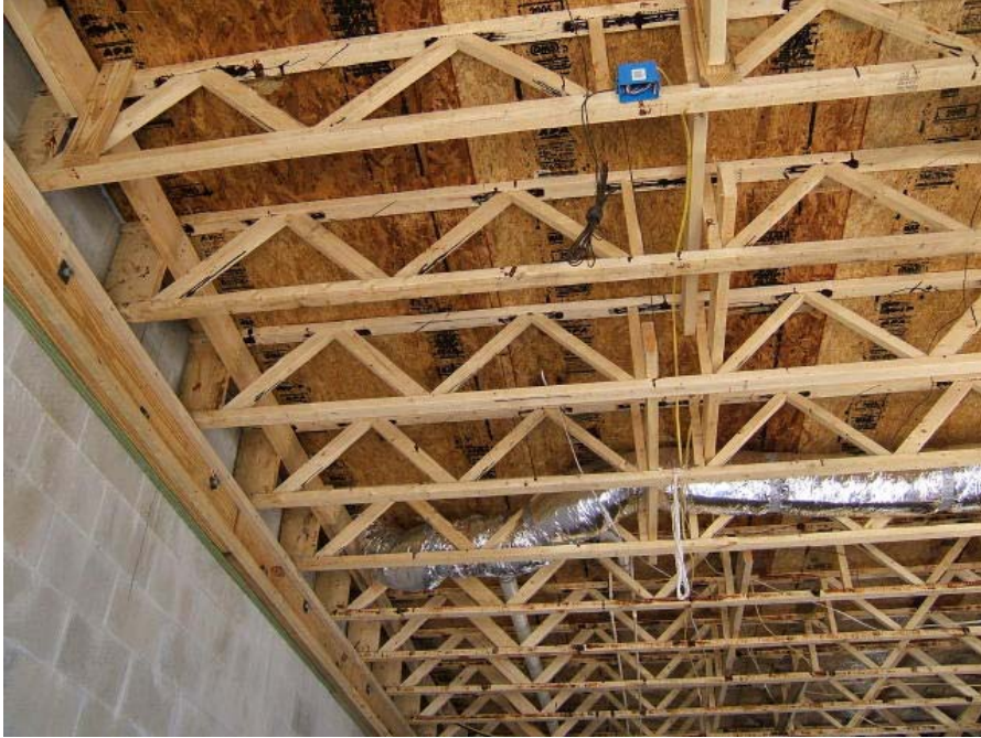
Figure 1: finger-jointed trusses in a ceiling