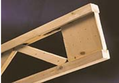
Figure 4: Finger-jointed truss